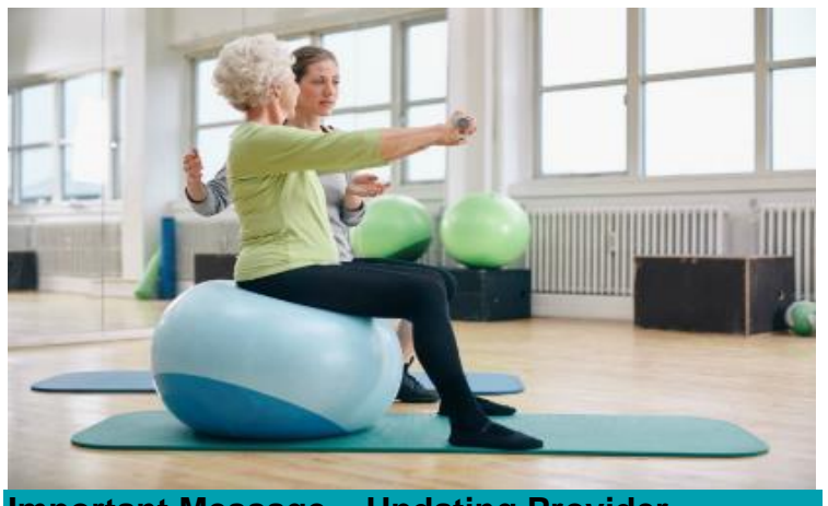
Important Message – Updating Provider Information

It is important for Molina Healthcare of California (Molina Healthcare) to keep our provider network information up to date. Up to date provider information allows Molina Healthcare to accurately generate provider directories, process claims and communicate with our network of providers. Providers must notify Molina Healthcare in writing at least 30 days in advance when possible of changes, such as: