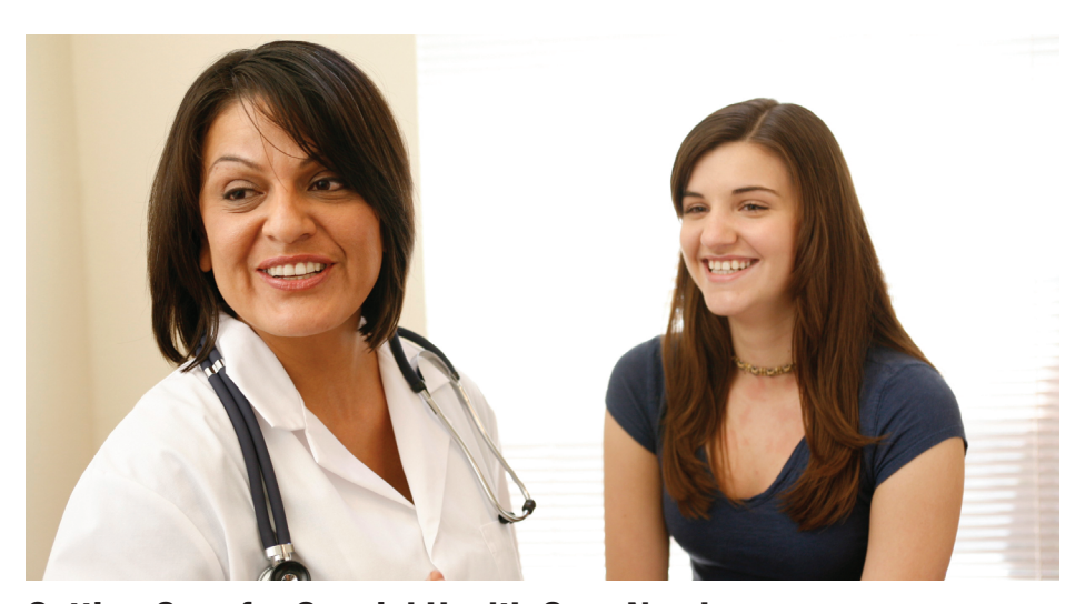
Getting Care for Special Health Care Needs You can go see specialists useful for your special health care needs

You can go see women's health specialists for your routine and preventive health care. Women's health specialists include: obstetricians, gynecologists, and certified nurse midwives. Routine and preventive care includes: care before birth, breast exams, mammograms and Pap tests.